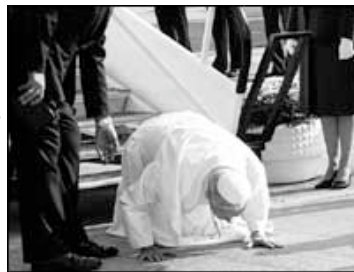
Pope John Paul II kisses the ground at Gatwick

But his visit was not welcomed by everyone - around 1,200