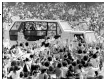
Crowds surround the 'Popemobile' in Glasgow