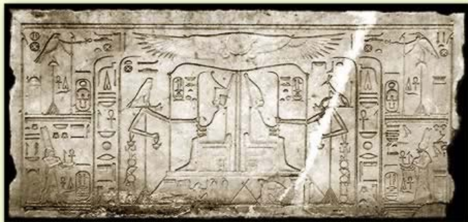
A Papyrus commemorating Senusret III's Sed-festival

"Appearing like the Souls of Re". Senusret III was most surely the son of Senusret II , changing a trend of having alternate leaders named Senusret and Amenemhet. We know of no co-regency with his father, though most of the previous 12th Dynasty kings shared at least a few years of their reign with their sons, and a co-regency would clear up some questions about Senusret III's long reign. His mother may have been Khnumetneferhedjetweret (Khanumet, Weret), who we believe was buried in a tomb near his pyramid at Dahshur. He was married to a principle queen named Mereret, who probably outlived him, and may have also been married to his sister, Sit-Hathor. His son and successor was Amenemhet III .