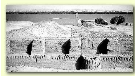
Fortification at Buhen

To facilitate these military actions in Nubia, he had an existing bypass canal around the First Cataract (rapids) at Aswan , originally dug in the Old Kingdom by Merene (or Pepi I ) cleared, broadened and deepened. According to an inscription, he had it repaired again in year eight of his reign. This canal was near the island of Sehel.