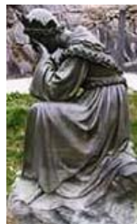
Our Lady of La Salette, restore the Holy Church