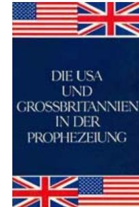
USA and Great Britain in Prophecy (1980 German)