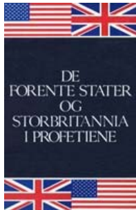
United States and Great Britain in Prophecy (1983 Norwegian)