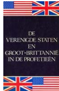
United States and Great Britain in Prophecy (1984 Dutch)

De Forene Stater Og Storbritannien I Profetierne