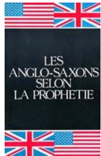
Anglo-Saxons in Prophecy (1982 French)