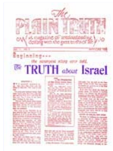
1938 Plain Truth articles