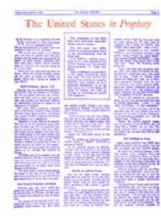
1940-42 Plain Truth articles