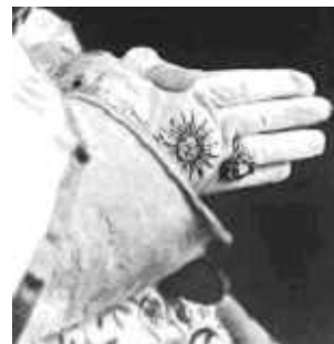
Note the prominent sun symbol on the glove of Pope John XXIII.