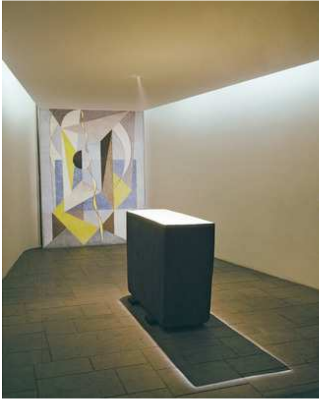
The Meditation Room at the UN Headquarters in New York

The underlying purpose of the Temple was plainly revealed by its plan, with the all-seeing Eye, faceted like a diamond in the central dome of the building, reflecting the rays of the sun through wings that represented six world faiths-Buddhism, Hinduism, Islam, Judaism, Confucianism, and Christianity.